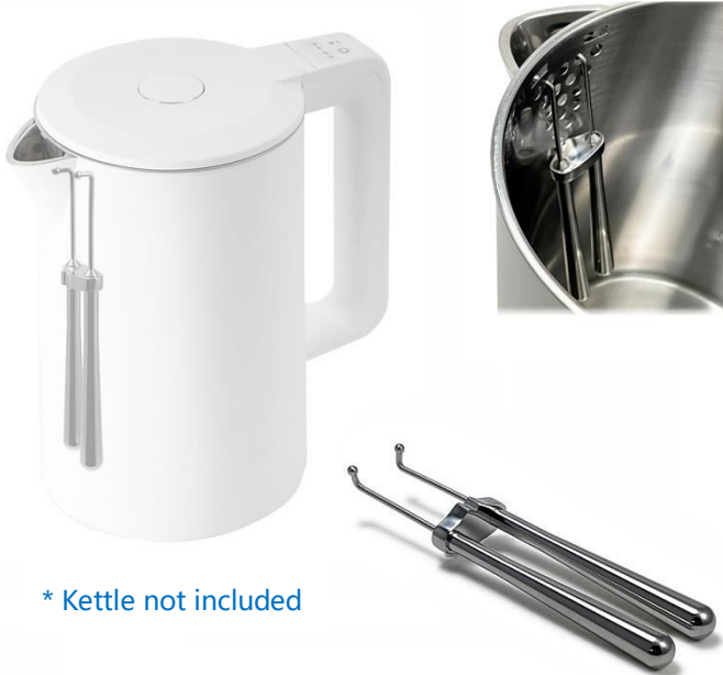
* Kettle not included

HKE KettleMate Hexagonal Water Generating Pendant is a hexagonal water generator specially designed for Kettle. The user only needs to put the pendant into the filter holes of the stainless steel kettle and boil it together with clean water. The boiled hot water becomes Hexagonal Water, also known as Structured Water, and in Europe, even called Revitalized Water.